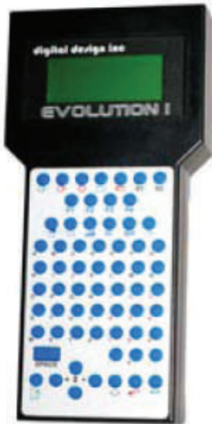
EVOLUTION I Hand Held Controller