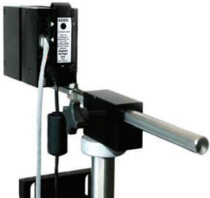
Printhead Module with Bracketry